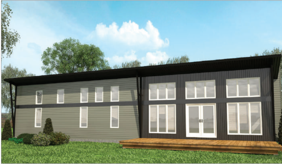
Drawing is artist's conception only