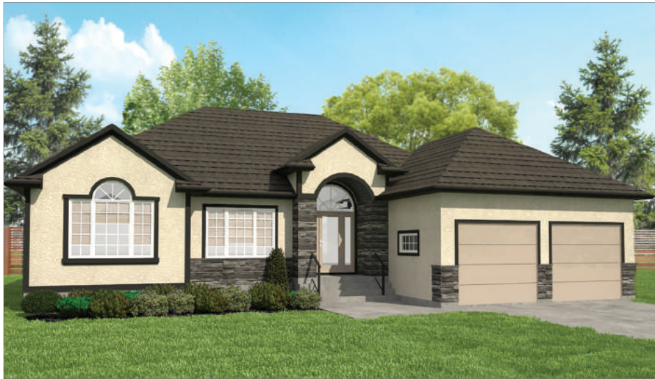
Drawing is artist's conception only