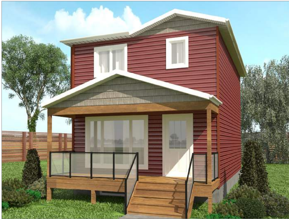
Drawing is artist's conception only