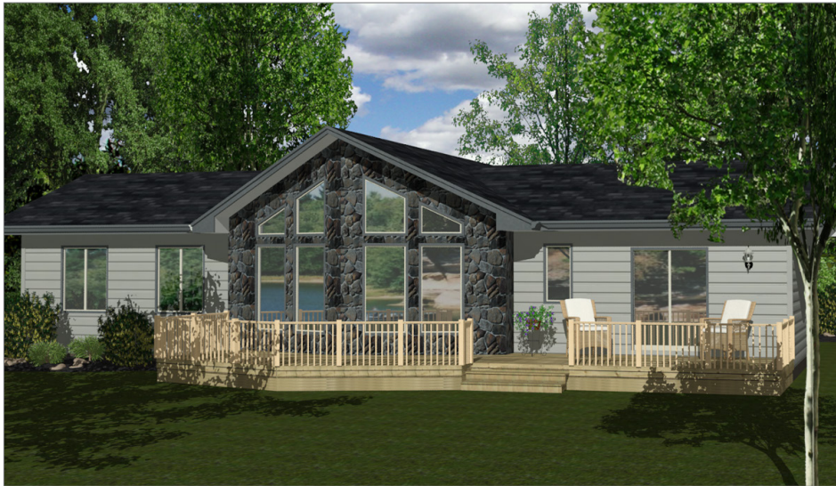
Drawing is artist's conception only