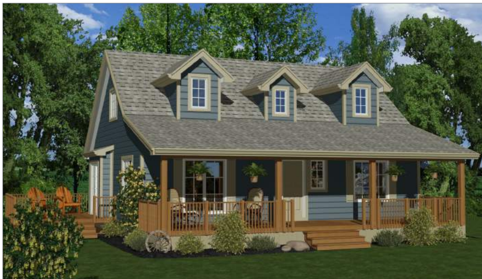
Drawing is artist's conception only